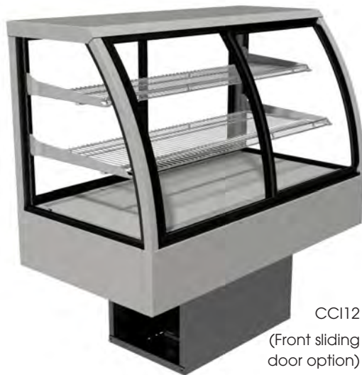
CCI12 (Front sliding door option)