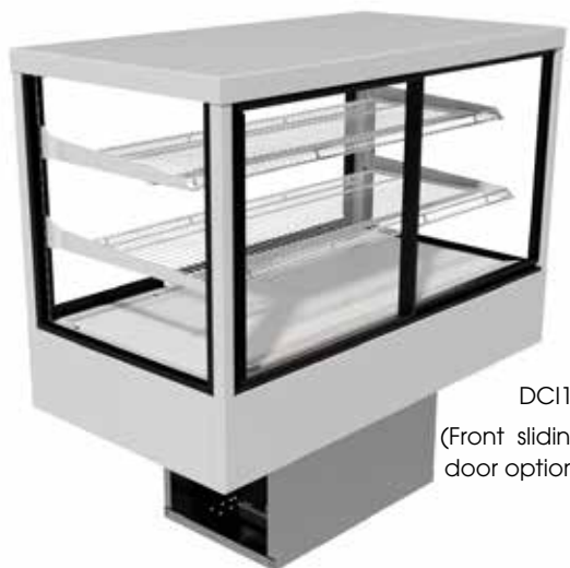
DCI12 (Front sliding door option)