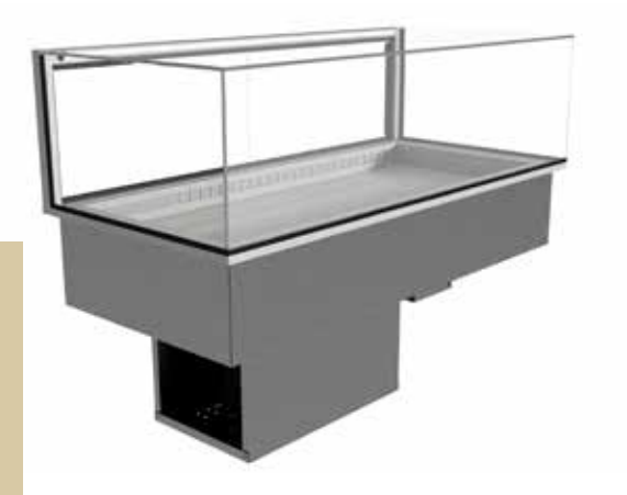
SCRW15 (Frameless Canopy and Rear Sliding Door options)