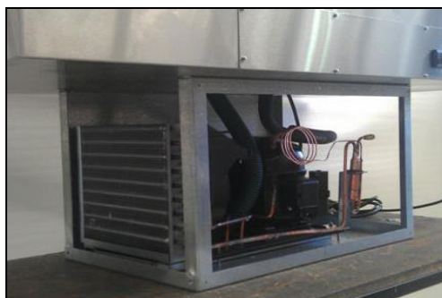
Condenser in Cradle attached under cabinet

Ensure the condenser unit has adequate ventilation. It is critical for the effective operation of the cabinet that the condenser fan is able to draw in cool air from the room and disperse hot air into the room. The refrigeration (condenser unit) of the cabinet is already attached to the underneath of the cabinet by a built in cradle.