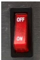
red toggle switch